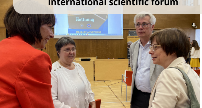
Hate speech in Hungary – international professional conference